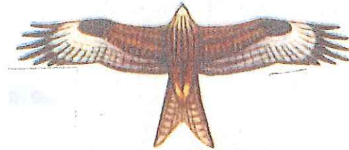
Wingspan 160cms length 62cms

RED KITES were reintroduced into the Chilterns about 15 years ago and have since spread to the surrounding regions. They are often seen over Wokingham now and frequently over the area around the Emm Brook. They are very distinctive birds and if you look UP as you walk along the brook you will often see them soaring. A big bird measuring about 62cms long and with a wingspan of 150 – 160 cms. Look for the distinctive outline in the sky, a deeply forked tail with red tail feathers.